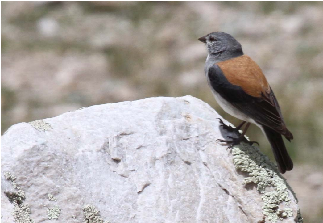
Red-backed Sierra-Finch