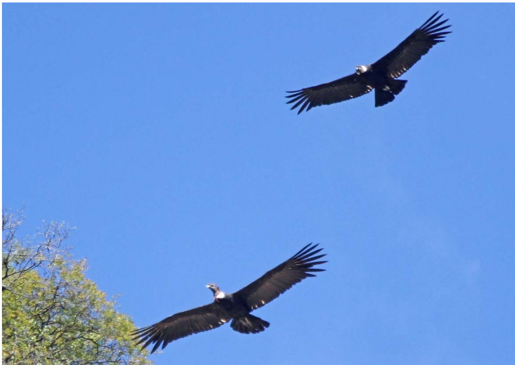
Andean Condors