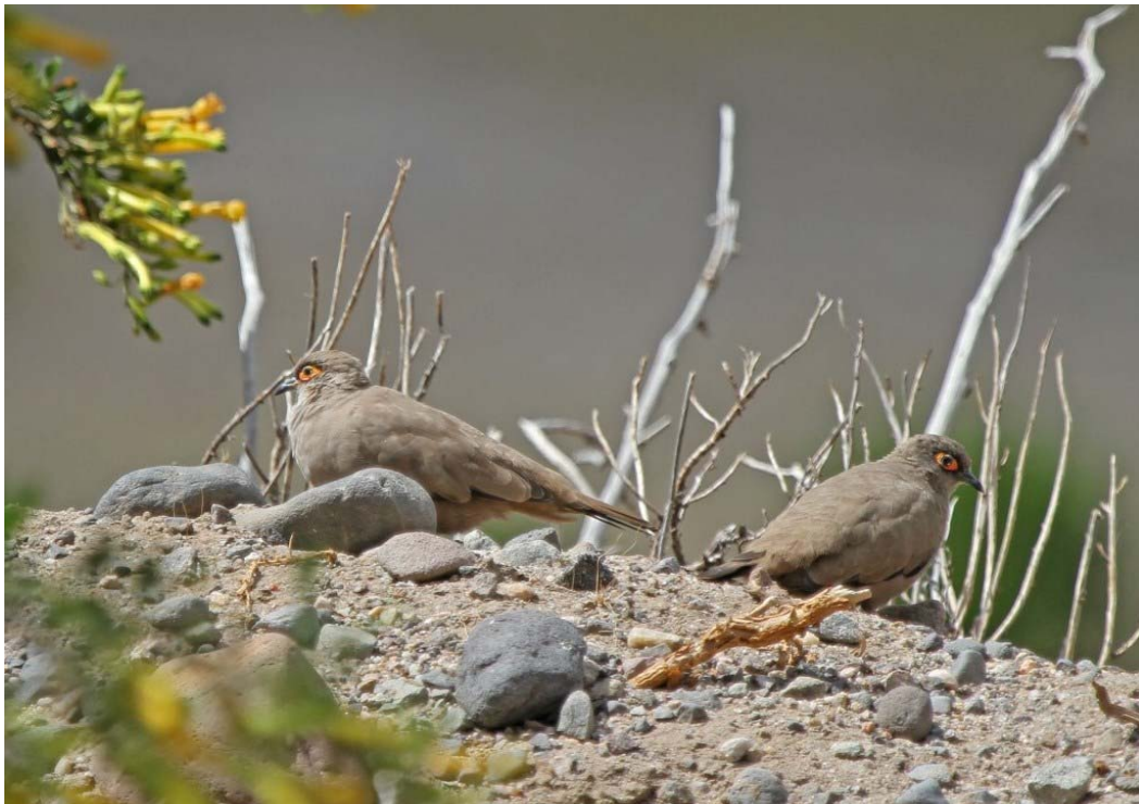
Bare-eye Ground-Dove