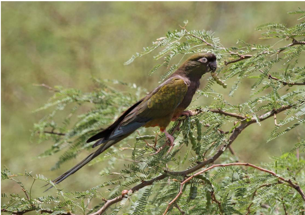
Burrowing Parrot