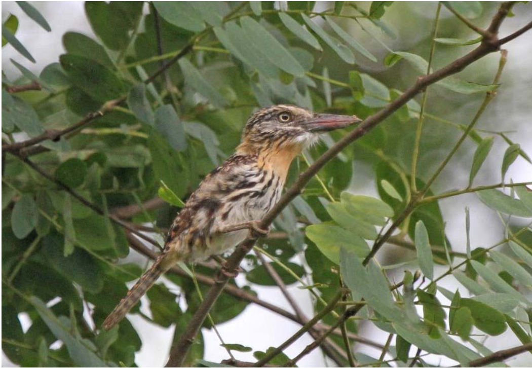
Spot-backed Puffbird