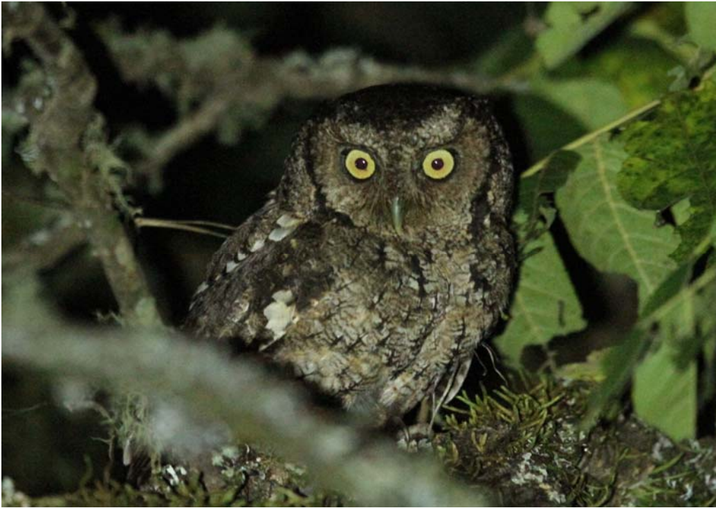
Hoy's Screech-Owl