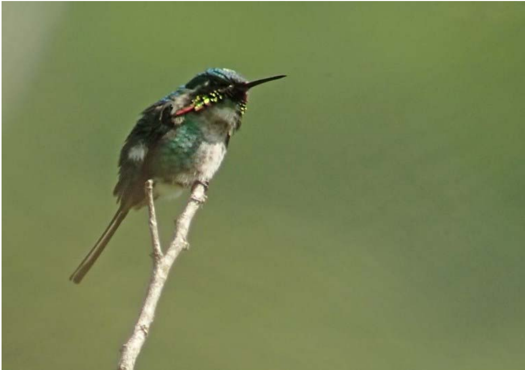
Slender-tailed Woodstar by Hector Slongo