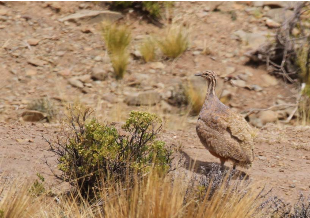
Puna Tinamou