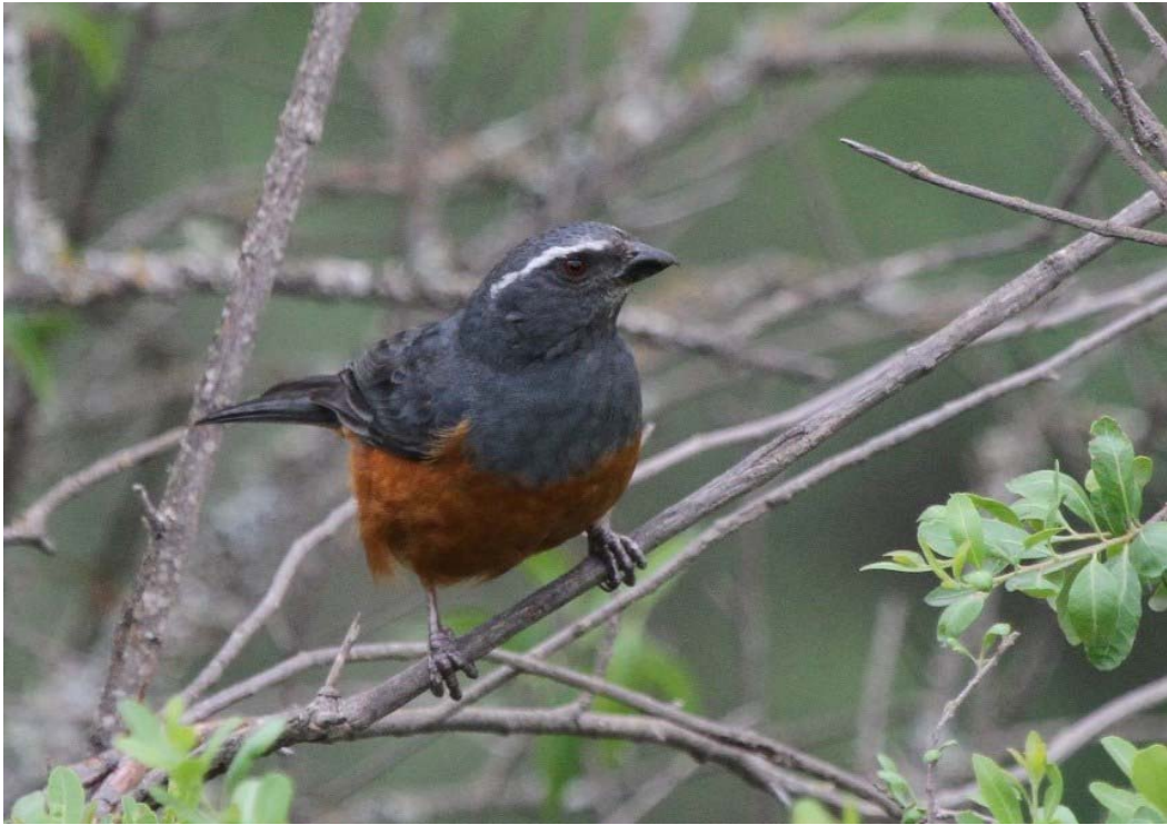
Rufous-bellied Saltator