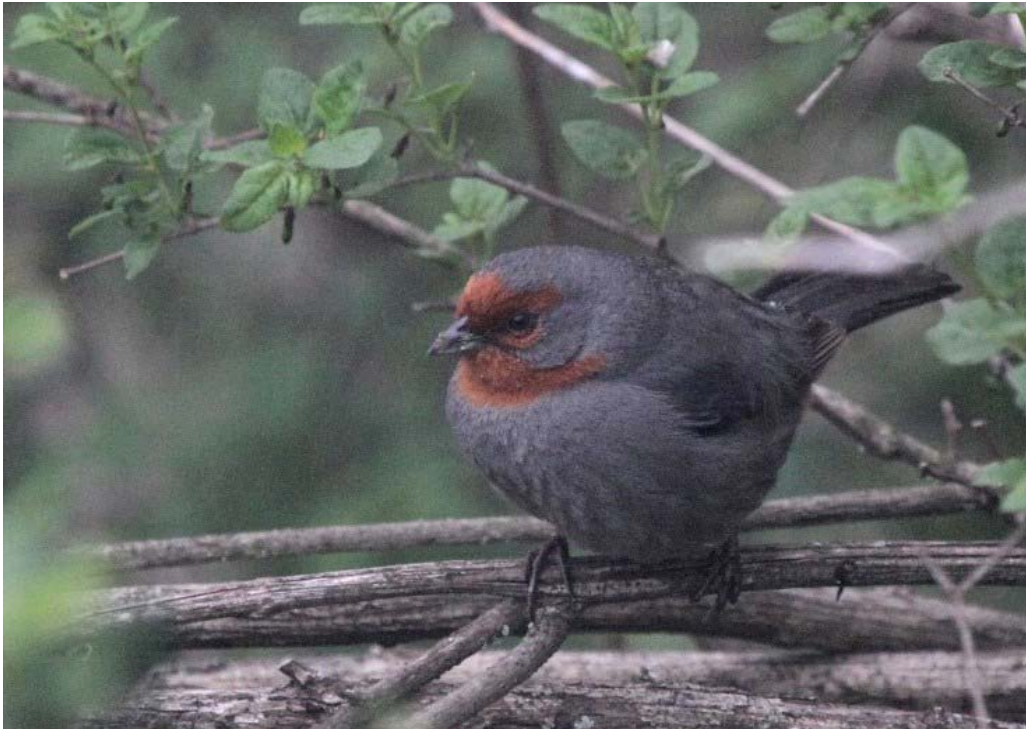
Tucuman Mountain-Finch