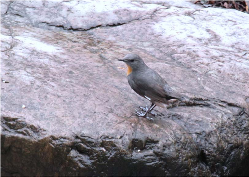
Rufous-throated Dipper by Hector Slongo