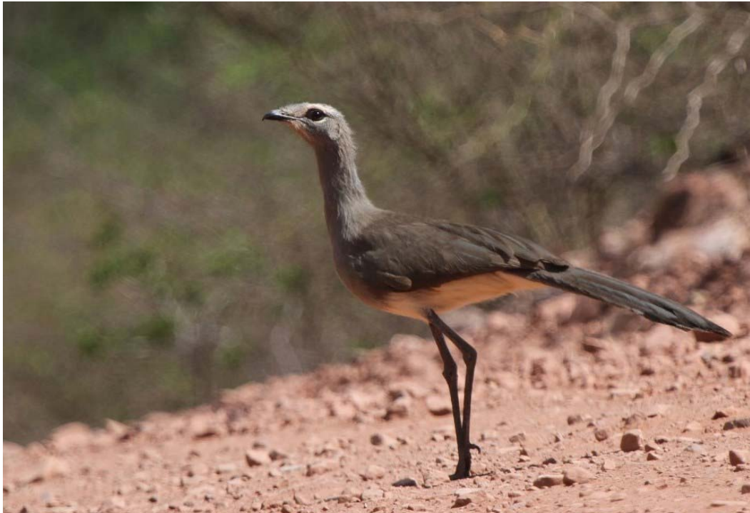
Black-legged Seriema