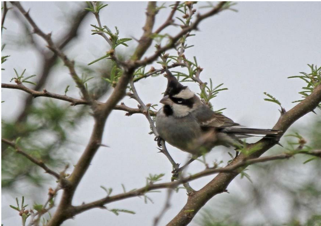
Black-crested Finch