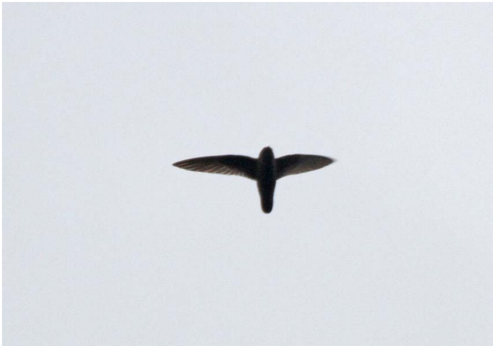
Rothschild's Swift